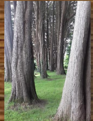
Estate trees grown in the past for aesthetics

iswe.bangor.ac.uk/ www.woodlandheritage.org/ https://www.facebook.com/groups/2223783770/ (BFSA)