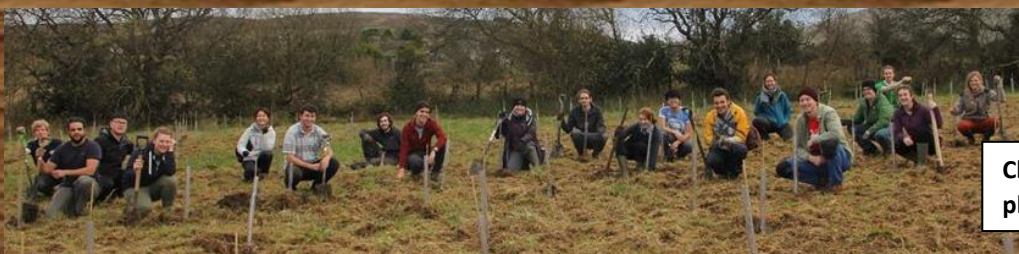
Chwith: Myfyrwyr yn plannu coed at y dyfodol

https://www.facebook.com/groups/22237837470/ (BFS)