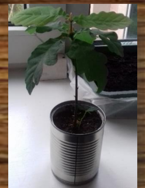
Uchod: derwen ifanc at y dyfodol

Trefnir gan Gymdeithas Myfyrwyr Coedwigaeth Bangor (BFS) mewn cydweithrediad â Sefydliad Ymchwil Ystadau Cymru a Woodland Heritage.