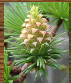
Tree producing cones in the present