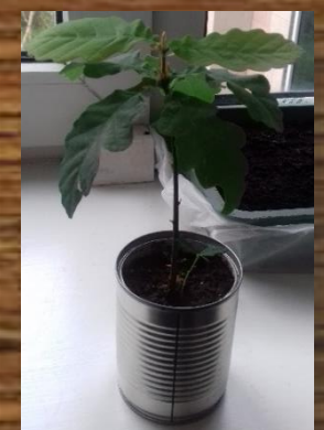
Above: oak seedling for the future